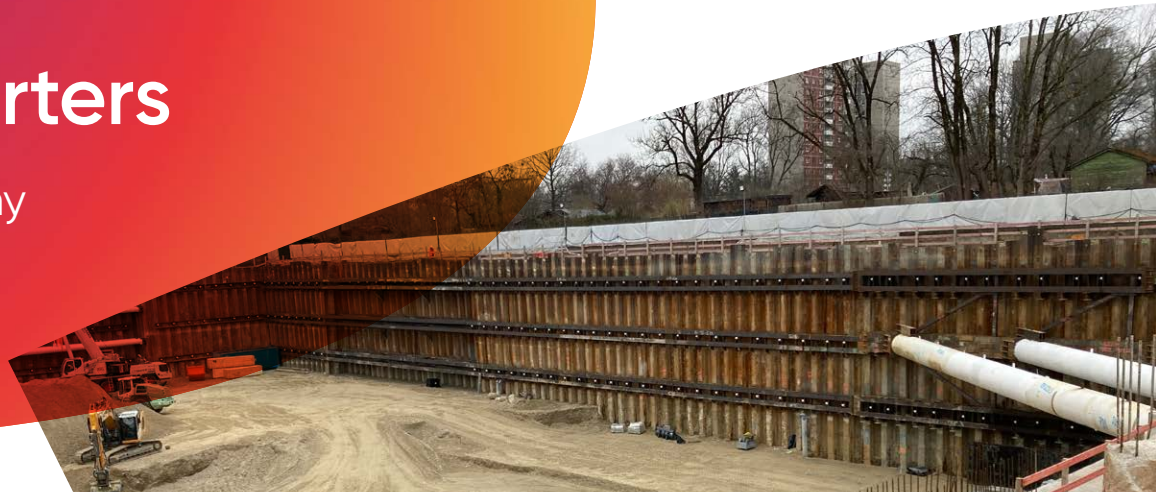
Shoring of the RS76 excavation pit in Munich