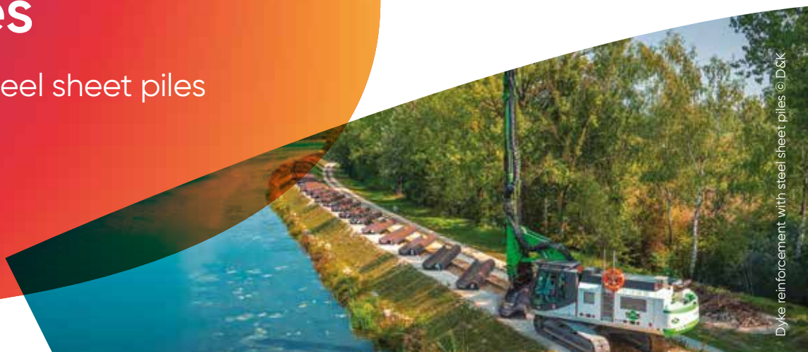
Dyke reinforcement with steel sheet piles