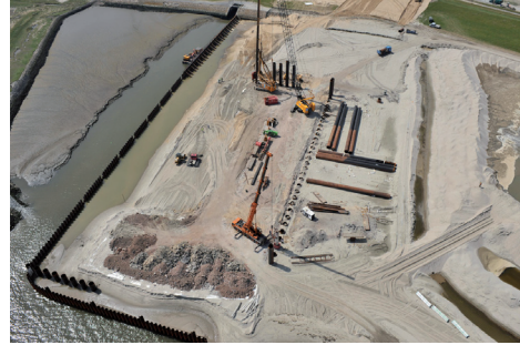
Aerial view of Berth 8, Cuxhaven

loading area, furthest away from the estuary, was entirely sealed off by the temporary sheet pile wall and then backfilled. Sand was also placed behind the temporary sheet piles installed in front of the planned waiting and mooring areas. Sand was piled up with ships and lorries to EL. +2.5 m. A stone-secured embankment permitted the reduction of soil pressure on the temporary cantilever PU 22 sheet pile wall. A vertical drainage system was installed to increase the bearing capacity of the soil, thus reducing the risks of later settlements. The PU 22 sheet piles were delivered on a rental basis from ArcelorMittal's nearby stock in Nordenham, off Bremerhaven.